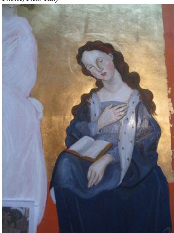
The Virgin is a portrait of Catherine of Aragon.