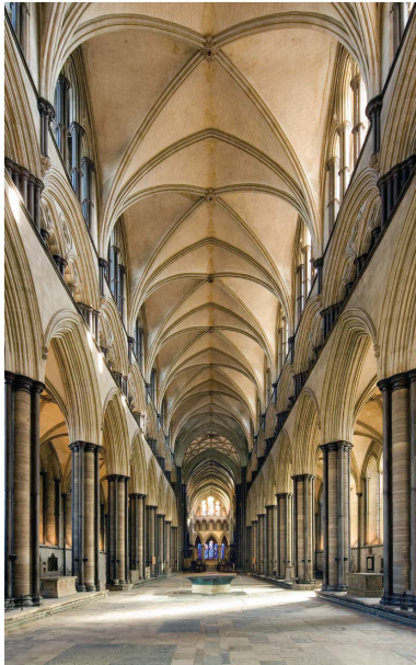
Photos, Salisbury Cathedral